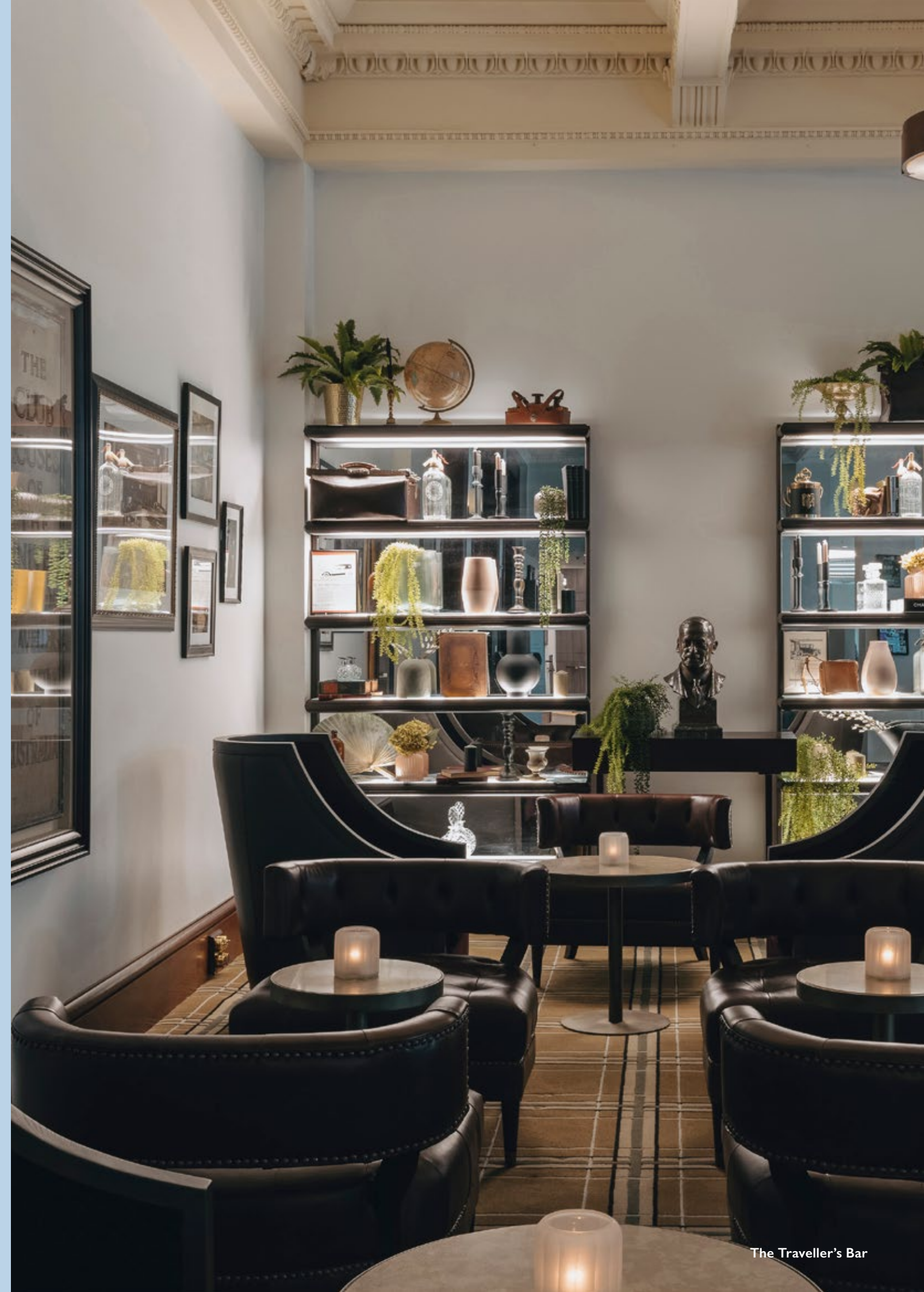
The Traveller's Bar

All deliveries into the hotel for events need to be labelled with Rendezvous Hotel Melbourne's delivery label. Please speak to your conference and event organiser about deliveries and the details will be sent through.